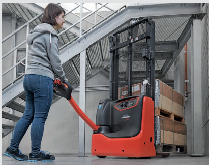
Precise load handling