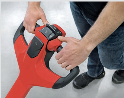
Ergonomic tiller head