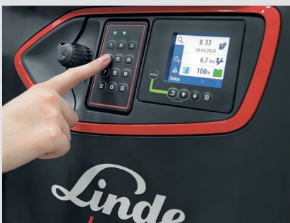
Easy access to truck data