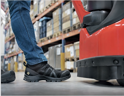
Active foot bumper (optional)